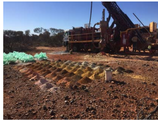
Drilling at the Jungle Hill Gold/Iron Project