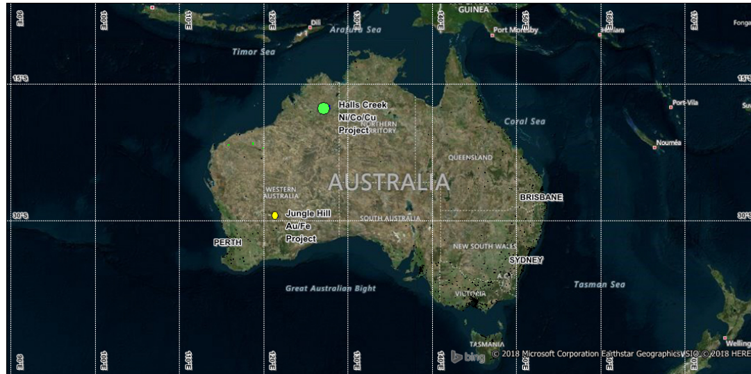
Location of Jungle Hill Au/Fe and Halls Creek Ni/Co/Cu Projects

Kaili Resources Limited is pleased to announce that its wholly owned subsidiary Kaili Gold Pty Ltd has completed drilling on its Jungle Hill exploration licence (E31/1114) south east of Kookynie in Western Australia. The drilling commenced on 12 th September 2018. In addition, four exploration licences with Nickel/Cobalt/Copper potential were granted to wholly owned subsidiary Kaili Iron Pty Ltd by the WA Department of Mines Industry Regulation and Safety for a period of 5 years. The exploration licences are located within a 50km radius of Hall Creek in northern Western Australia.